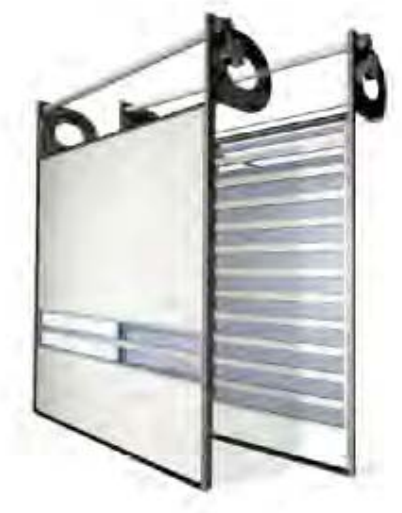
U-value VERTIgo ISO-40 mm sectional door: 5,000 \times 5,000 \text{ mm} : 1.77 \text{ W/m}_2\text{K} U-value VERTIgo ALU-40 mm sectional door: 5,000 \times 5,000 \text{ mm} : 4.25 \text{ W/m}_2\text{K}

The EBS VERTIgo is an unprecedentyl fast sectional door that also offers exceptional insulation performance and security. Specially designed rollers keep noise to a minimum. This patented system also contributes to the sleek design of the VERTIgo. The EBS VERTIgo can be supplied in 2 variations, the VERTIgo ISO-40 and ALU-40. Both door types have 40mm thick panels; ISO-40 produced with steel PIR sandwich panels and ALU-40 manufactured with clear double glazed aluminium panels.